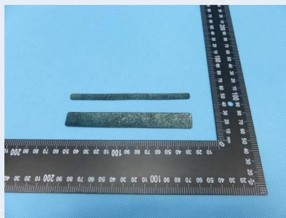
Reference Sample (Reverse)